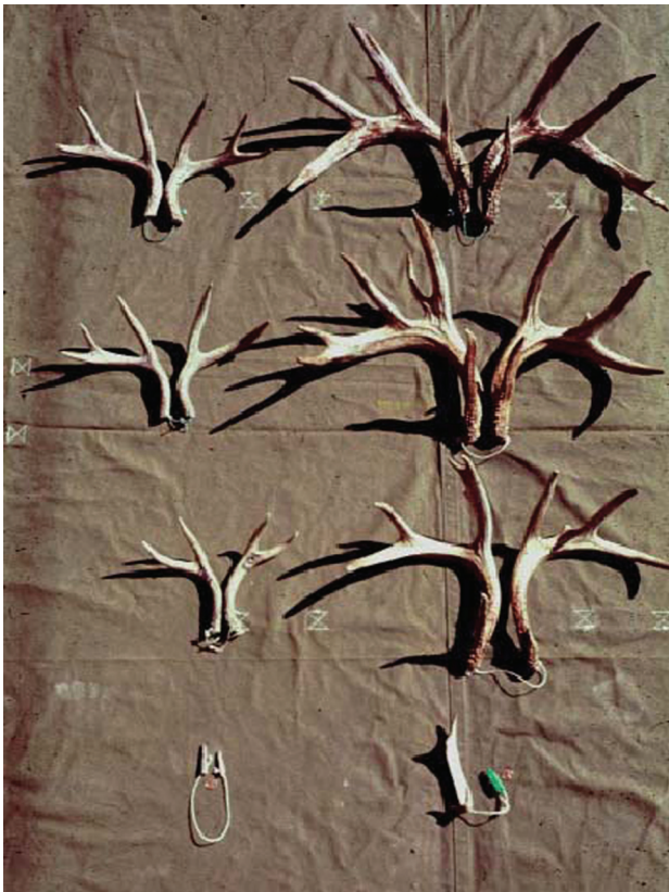
The first four sets of antlers from Little Murph (left) and Big Charlie (right). It's a stretch to say Big Charlie's yearling antlers have six measureable points.

Since their publicly stated goal was to produce true breeding lines, I can only guess who these does were! Two-thirds of the bucks produced by Big Charlie came from three does. Finally, when we look at the birth dates of fawns produced by the nine bucks in the study, guess whose sons generally were born earlier? That is right, Big Charlie. I hope you have been able to follow most of this.