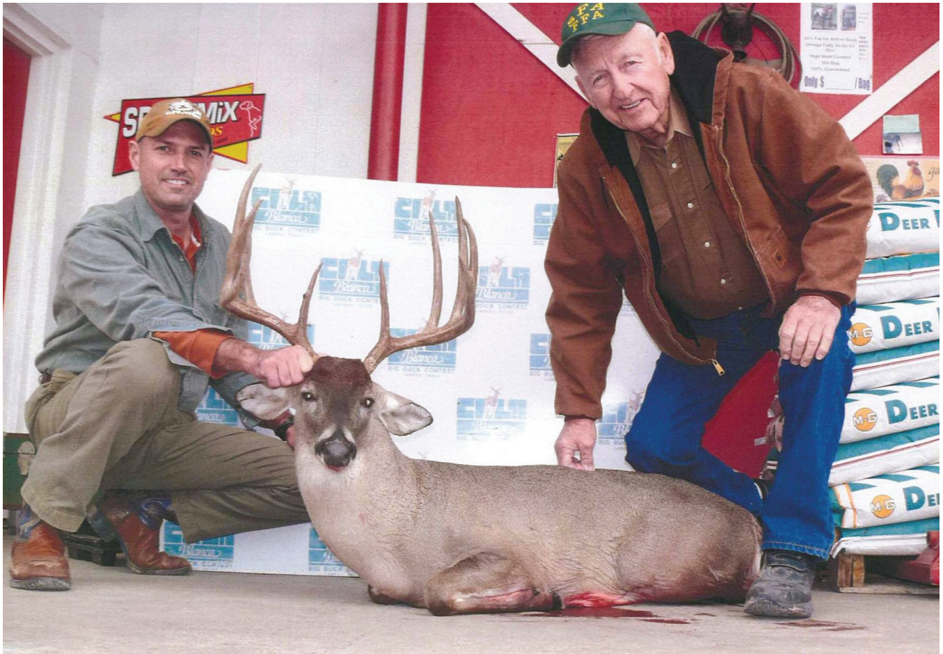
According to the author, another study conducted in Mississippi concluded spike yearlings would grow into equally good bucks. Other studies tended to substantiate the Mississippi results. In fact, no study to date has replicated the TPWD/Kerr WMA results; and science is founded on replication of results.

your property probably will end up on another property. Furthermore, we conducted a culling simulation study on our yearling antler data, factoring in peer-reviewed, published year-to-year mortality rates. We learned, if you cull all yearling bucks with eight or fewer points, you end up with NO 2-year-old bucks! Drop back to six or fewer points, and you get one! A paper given at the 2010 Southeast Deer Study Group Meeting in San Antonio found essentially the exact same thing, only with on the ground application. If you intensively cull yearlings, you can end up with few mature bucks!