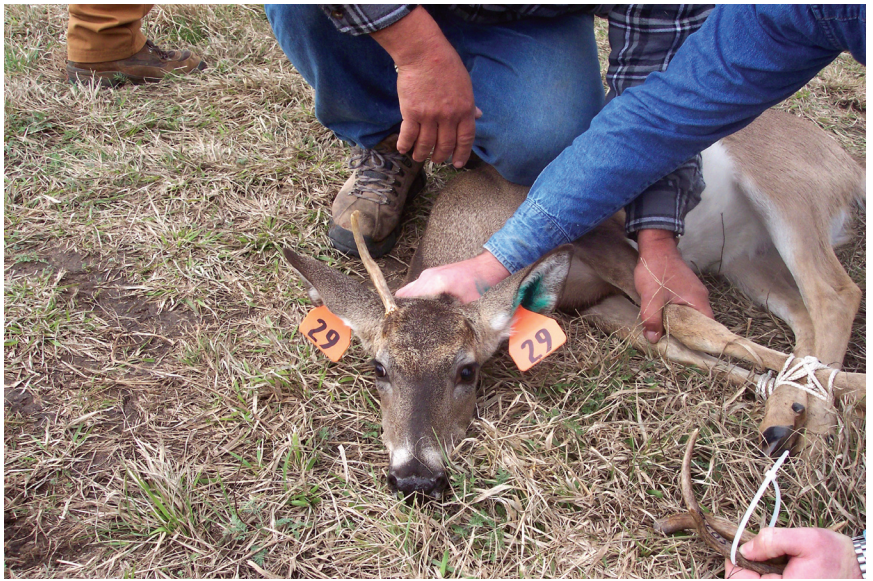
A Texas Parks and Wildlife study concluded spike yearlings were “vermin” needing total removal. According to the author, whether or not to support spike shooting in Texas has turned into a loyalty test.