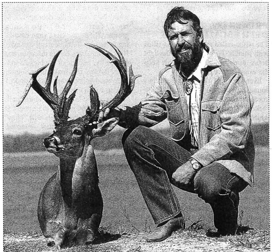
A buck of the quality of the "Boggy Slough Monster" is a trophy for any hunter. But there was a relatively new twist to the author's killing of this buck in 1987: He used a grunt call to lure this whitetail in!