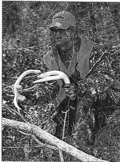
While rattling isn't a vocal "call," the sound definitely can lure bucks into shooting range at the right stage of the rut. Mixing in some grunts with the clashing of antlers helps sell the ruse.