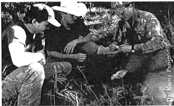
Students learn by doing, not just reading about it.

ty's colors are purple and white. "Purple Pride" is every where in Nacogdoches. Why not call it the Purple Heart Scholars Program?